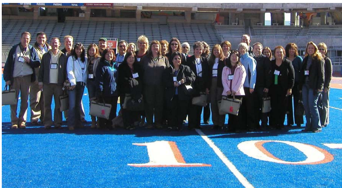
On the Blue Turf!