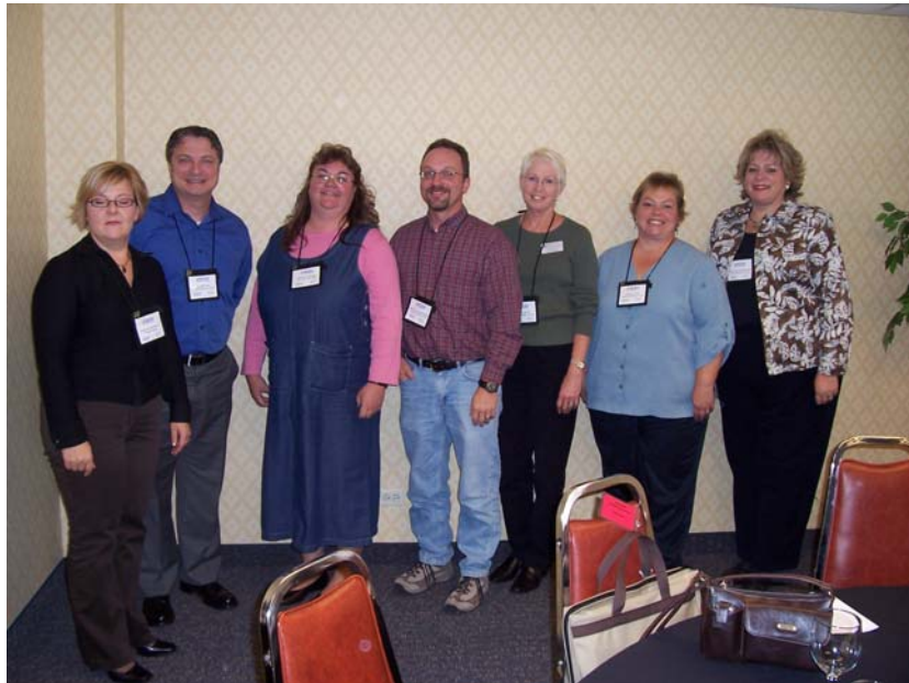
Welcome to some of our newest members!